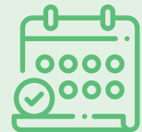
Workflows, calendars and email reminders