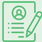
Training and education